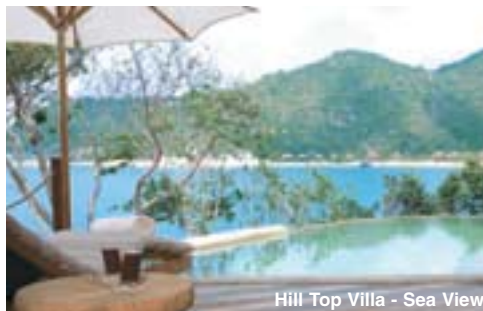
Hill Top Villa - Sea View