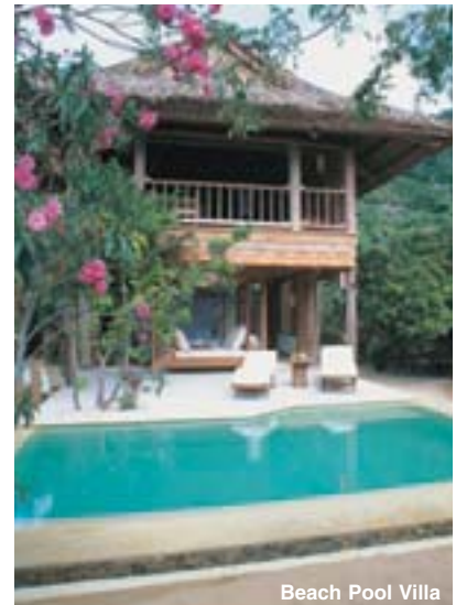
Beach Pool Villa

Special Comment – Amazing boutique resort - the location & scenery are as dramatic as the resort is luxurious.