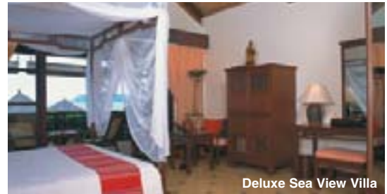
Deluxe Sea View Villa